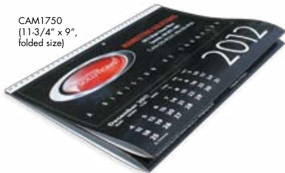
CAM1750 (11-3/4" x 9", folded size)

Glossy lamination for stunning impact! Also folds for convenient presentation and handling.