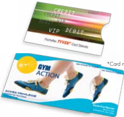
*Card not included.