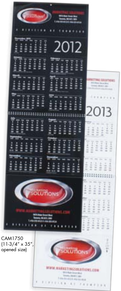
CAM1750 (11-3/4" x 35", opened size)

Glossy lamination for stunning impact! Also folds for convenient presentation and handling.