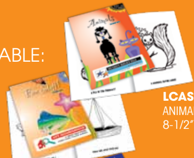
LCAS1 ANIMALS 8-1/2" X 11"