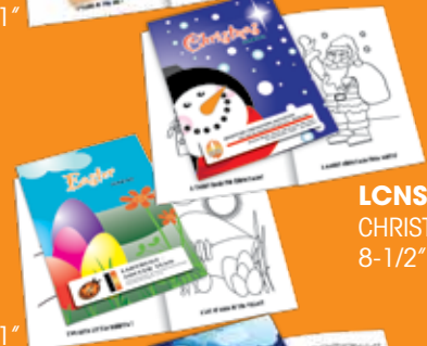
LCNS1 CHRISTMAS 8-1/2" X 11"