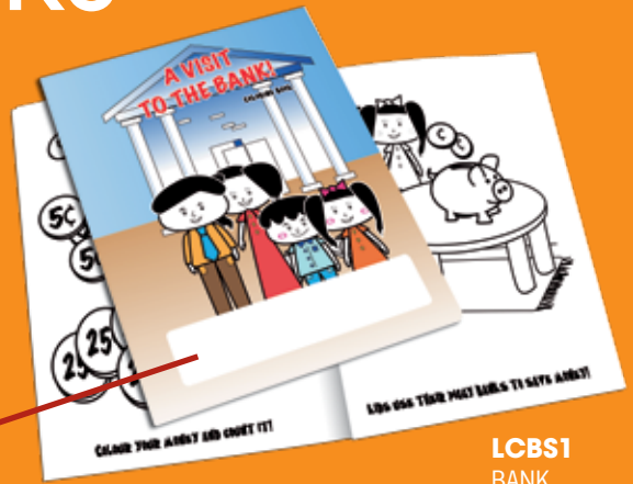
LCBS1 BANK 8-1/2" X 11"