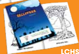
LCHS1 HALLOWEEN 8-1/2" X 11"